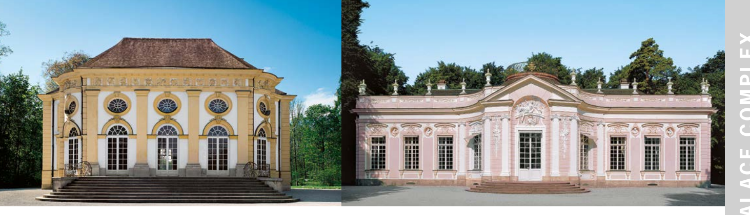
Badenburg from the north