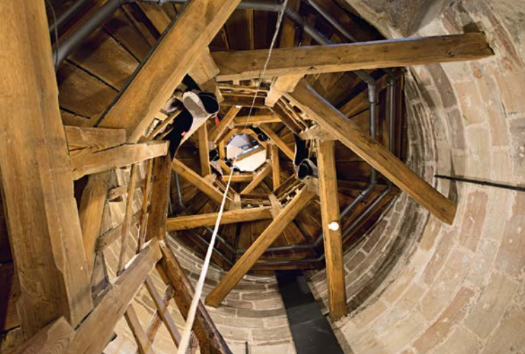
View into the staircase in the Sinwell Tower