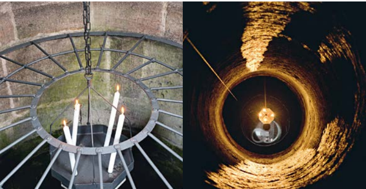
View into the shaft of the Deep Well

The Sinwell Tower – the round tower in the outer bailey – was the keep that served for defensive and status purposes. Built in the late thirteenth century, the slim tower had an additional storey with a broad projecting platform and a Renaissance helm roof added to it in the 1560s. When the view of the Castle and the old town is compared with photographs from the period before and after the Second World War, the extent of the wartime damage and later reconstruction becomes clear. The Deep Well at the centre of the outer bailey was very probably created in its earliest building period to provide an independent water supply for the Castle. The shaft goes down nearly 50 metres deep into the castle rock. A film showing a descent into it, and a vivid guided tour, enable visitors to appreciate its depth.