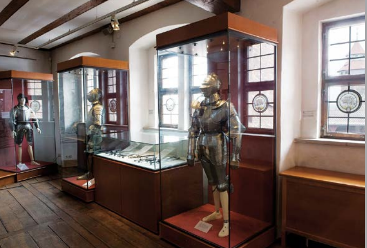
View of the exhibition rooms in the ‘Kemenate’