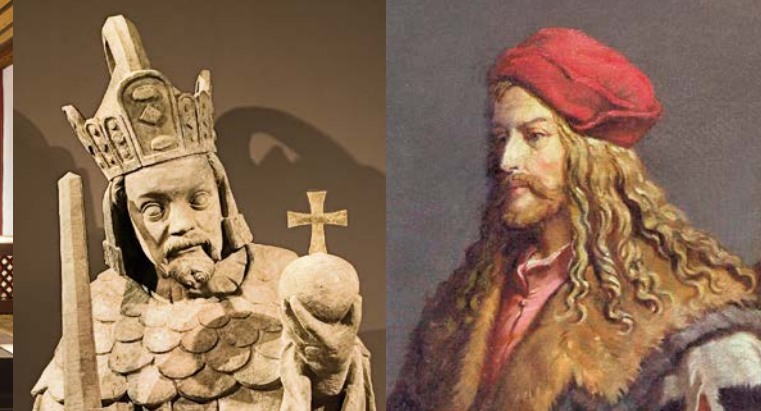
Emperor Charles IV (l.); Albrecht Dürer (r.)