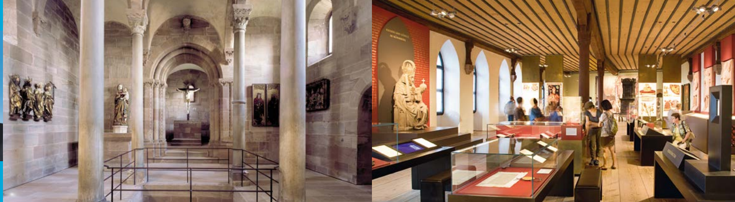
Upper chapel, view towards the choir, c. 1200