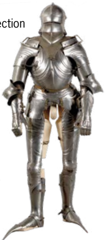
Equestrian suit of armour, probably from the Nuremberg Arsenal, 1470/80, Nuremberg, Germanisches Nationalmuseum

Booking for guided tours of the Weapons Collection of the Germanisches Nationalmuseum: Museums of Nuremberg Art and Cultural Education Centre (KPZ) Kartäusergasse 1 · 90402 Nürnberg Dept. II, Adults and Families: Tel. +49 911 1331-238