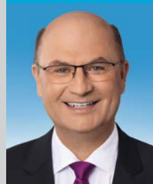
Albert Füracker, MdL State Minister

We wish you a fascinating visit to the Imperial Castle in Nuremberg!