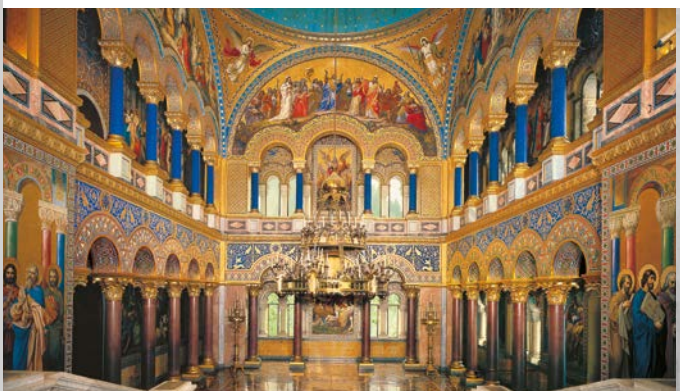
The walls of the Throne Hall glorify canonized kings and their deeds.

He learned much about the legends and history of the period from the murals and through avid reading. From 1861 he was decisively influenced by his encounter with the music dramas of Richard Wagner, who heightened the effect of the medieval sagas with incredibly powerful music. Ludwig first saw 'Lohengrin' and 'Tannhäuser'. These were followed by 'Tristan und Isolde' and 'Der Ring des Nibelungen', and Wagner's adaptation of the saga of the Grail King Parzival ('Parsifal'), with whom Ludwig II identified in his later years and with whom he was identified by Wagner. One of the most famous castles in Germany, the Wartburg, had been renovated and refurnished in 1867 and became a direct model for Neuschwanstein. In the 19th century, building in historical styles meant 'perfecting' them, also with the help of modern technology and historical studies. As a thoroughgoing idealist, Ludwig II clung to an already completely outdated belief in such perfection.