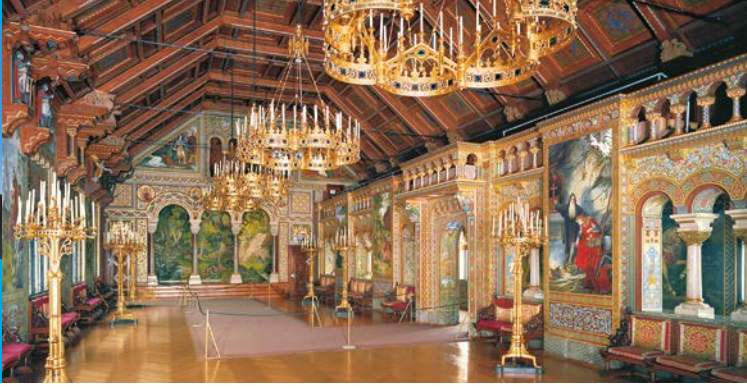
The Singers' Hall on the fourth floor of the castle

Bayerischer Staatsminister der Finanzen und für Heimat