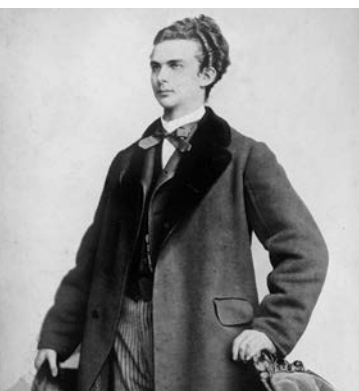
Photo of King Ludwig II in civilian clothes (l.); Mural of 'St. George killing the dragon' from the Throne Hall (r.)

He learned much about the legends and history of the period from the murals and through avid reading. From 1861 he was decisively influenced by his encounter with the music dramas of Richard Wagner, who heightened the effect of the medieval sagas with incredibly powerful music. Ludwig first saw 'Lohengrin' and 'Tannhäuser'. These were followed by 'Tristan und Isolde' and 'Der Ring des Nibelungen', and Wagner's adaptation of the saga of the Grail King Parzival ('Parsifal'), with whom Ludwig II identified in his later years and with whom he was identified by Wagner. One of the most famous castles in Germany, the Wartburg, had been renovated and refurnished in 1867 and became a direct model for Neuschwanstein. In the 19th century, building in historical styles meant 'perfecting' them, also with the help of modern technology and historical studies. As a thoroughgoing idealist, Ludwig II clung to an already completely outdated belief in such perfection.