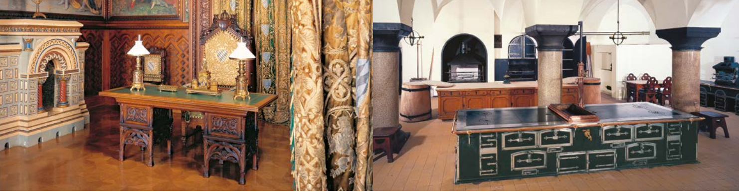
Study with desk of King Ludwig II