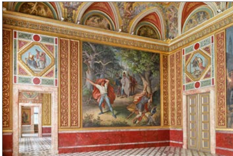
d Nibelungen Halls