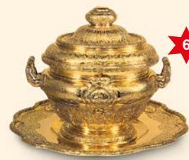
6 Gold-plated silver terrine with the coat of arms of Elector Max Emanuel, Paris, 1714/15