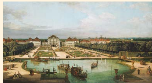
9 Nymphenburg Palace , painting by Bernardo Bellotto, also called Canaletto, 1761