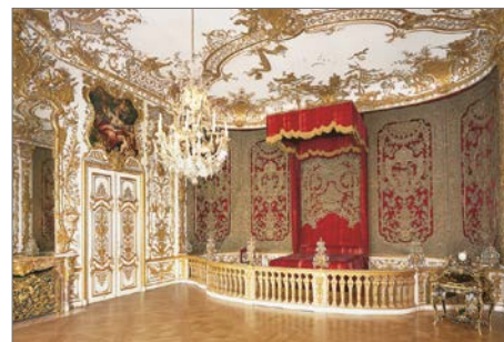
e Ornate Rooms