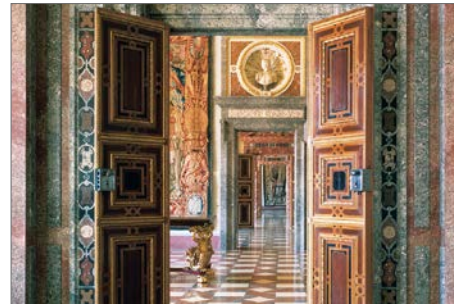
f Stone Rooms