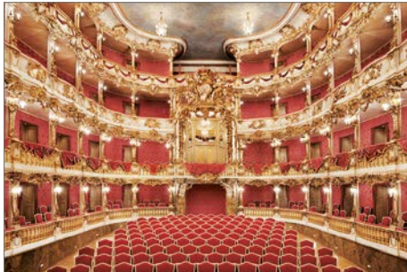
a Cuvilliés Theatre