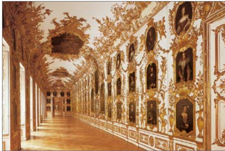
b Ancestral Gallery