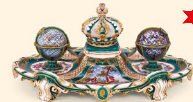
8 Writing utensils of Madame Pompadour , Sèvres porcelain manufactory, 1760/61