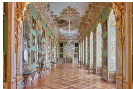
h Green Gallery