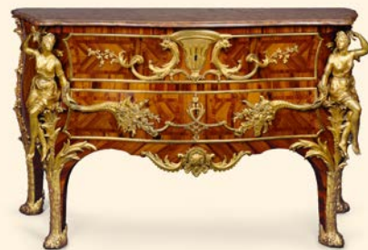
Commode 'with nymphs' , Charles Cressent, Paris, c. 1730/1735