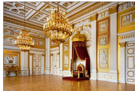
e King's Building