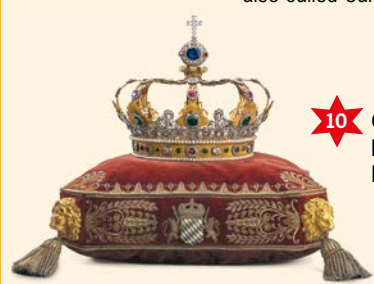
10 Crown of the kingdom of Bavaria , Martin Guillaume Biennais, Paris, 1806