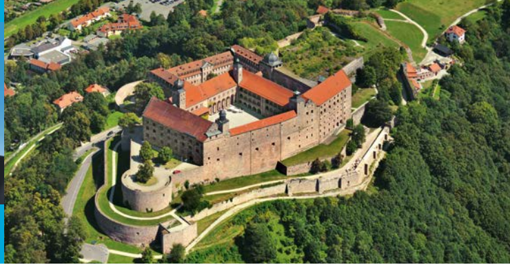
Plassenburg Castle above Kulmbach