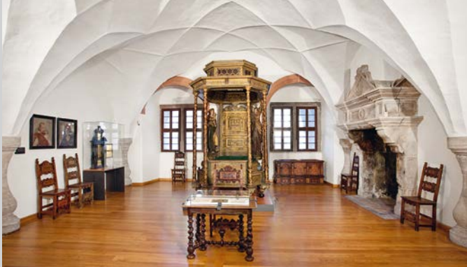
Margravine Maria's State Bed in the museum, c. 1630