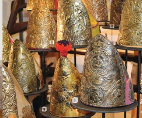
Prussian Grenadier and Fusilier Privates' caps, 1740–1770 (left), Margrave Johann Friedrich, 1659 (right)