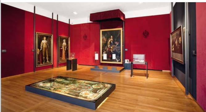
Exhibition room in the museum

Prussian dominance and the endeavours of the Prussian kings to preserve the Franconian monuments of their family. The museum was established together with the »Haus der Bayerischen Geschichte« and the State Collections of Bavaria, in particular the Bavarian Army Museum.