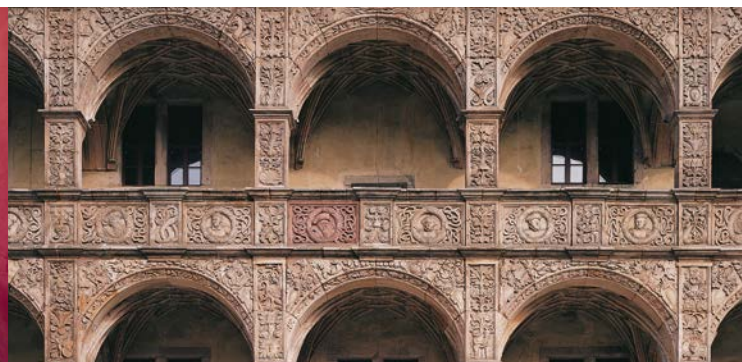
The arcades in the »Schöner Hof« are decorated with reliefs

The museum in the most important Hohenzollern fortress in Bavaria has the largest existing collection of old Prussian military items dating from 1700 to 1806, which are on display in 32 glass cases. It documents the outward appearance and inner structure of an army which altered the course of history on the battlefields of 18th-century Europe and focuses in particular on the time of Frederick the Great (1740–1786). The infantry and cavalry are described in detail, as well as the social structure of the troops. The main exhibits are firearms, swords, flags and paintings. The museum was established jointly with the collector and historian Bernd Windsheimer.