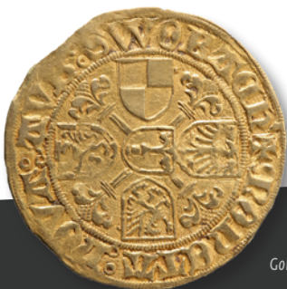
Gold guilder, probably 1470 – 1486

At the end of the Second World War the castle went up in flames. A few decades ago the Bavarian Palace Department began to restore it, first securing the rock on which it stood and the building substance. The opening of the museum in 2017 marked the completion of the conversion of the Old Palace that was commenced in 2005.