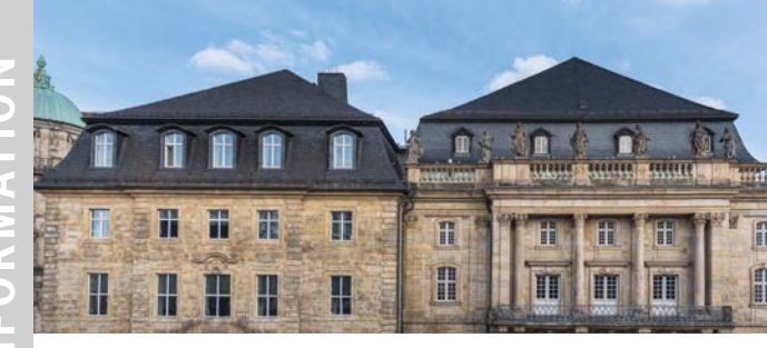
Redoutenhaus and Margravial Opera House