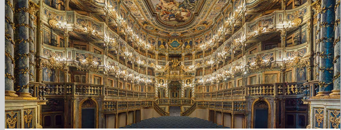
Interior of the Margravial Opera House ...