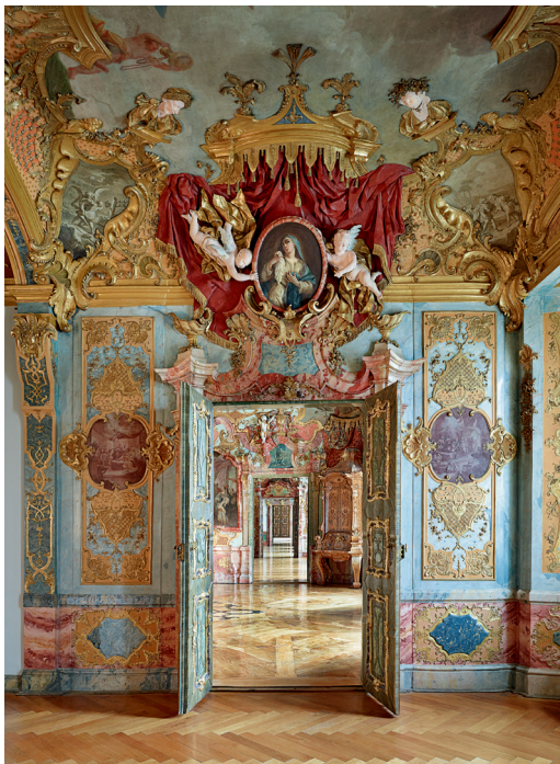
View from the bedroom towards the Banqueting Hall (left)

The sequence of the rooms is typical of the apartments of 18th-century regents: banqueting hall, antechamber, audience room, salon, bedroom. All that is missing is the cabinet that is usually adjacent to the bedroom, which has been replaced by the chancellery. From 1732 to 1735 the team of artists worked on the actual residential rooms, which are in the late régence style, and from 1740 to 1742 on their crowning achievement, the Banqueting Hall, which is probably based on a design by Dominikus Zimmermann and is one of the most magnificent examples of the Bavarian rococo style. The rectangular hall two floors high with five window axes is distinguished by its subtle, well-balanced architectural design, and is decorated with elaborate stucco-work figure compositions by Johann Georg Üblher. The entire barrel vault is decorated with a ceiling painting by Franz Georg Hermann which glorifies the monastery and its history. The unusual presence of sacral architectural and decorative elements in a royal palace and the strong, warm colours which give the rooms their cheerful and comfortable appearance make the prince-abbot's apartments unique.