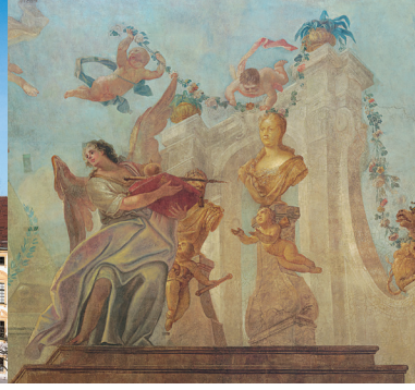
Residence and abbey church St Lorenz (left); detail from the ceiling painting in the Banqueting Hall (right)